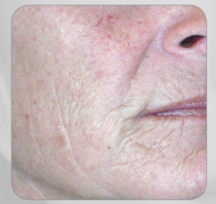
8 weeks after 1 treatment